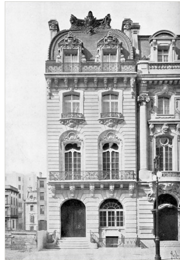
Upper East Side Mansion

The Upper East Side of New York City was, and is still, much larger than the Lower East Side. Spanning the areas of 59th Street, 110th Street, 5th Avenue, and the East River, the Upper East Side was also an attractive place for immigrants. In the late 1860s development of the Upper East Side began. The building of brownstones and mansions on 5th Avenue attracted a more wealthy population of high-society moguls, debutantes, scions, and heirs who made the Upper East Side a very ritzy and glamorous place to live. Adding to its appeal, the new concept of public transportation made it easier for Upper East Side residents to travel throughout New York City. Included among the upper-class families that relocated to the Upper East Side were The Rockefeller, The Kennedy, and Roosevelt families.